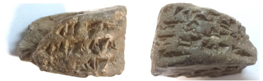
Figure 5a

The bullae of Bastam are sometimes inscribed with KIŠIB (seal) (Dara, 2017: 228, 230, 231, 239-242), personal names and toponyms indicating differen lands, regions and cities (ibid: 232-238). On some, such as as bulla no. 13320, Ba 78-146<sup>xv</sup> (Fig. 5a) and no. 51115, BA 78-423<sup>xvi</sup> (Fig. 5b) "The Small City of Rusa" is mentioned.