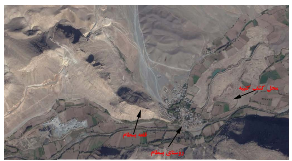
Figure 7. The discovery point of the inscription

A large broken stone block made of a pink sedimentary rock has been donated to Maku Office of the Cultural Heritage Ministry. Recently, this stone block was transported to the Urmia Museum from Maku. It was discovered during the course of the construction of the Agh Chay Dam behind the Bastam fortification, east of Bastam village in 1996 (Fig. 7).