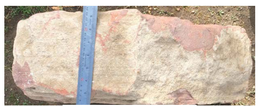
Figure 9a. Upper part of the stone

The gap between the signs is increased in the last nine lines. It is possible that the scribe did not pay attention to the length of the text and the text was shorter than expected. Therefore the scribe was obliged to add to the gaps between the signs to fit the length of the text with the size of the stone block.