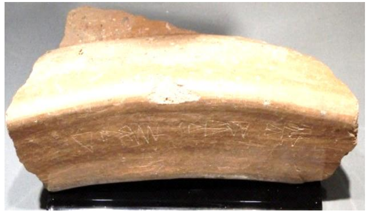
Figure 4a (Dara, 2017: 220)

Several pieces of inscribed ceramic vessels discovered in Bastam (Kroll, 1979: 221; Salvini, 2012: 225-250; Dara, 2017: 201-224). The vessels were used to store wine, oil, water, wheat, and barley (Salvini, 2012: 223). Therefore, they were mostly inscribed in Urartian cuneiform and hieroglyphs to indicate their measurement and according to their capacity. Three of the inscriptions are inscribed on the edge of the vessels with the short version of {}^{m}ru -URU-TUR and are stored at the National Museum of Iran (Fig. 4). x^{iv}