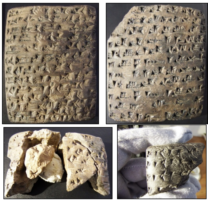
Figure 3 a-d (Dara, 2017: 136)

Urartian tablets have been discovered at Bastam during the excavations of 1969, 1970, 1973 and 1974 which are in National Museum of Iran (Salvini, 1979: 115). Tablets could bring crucial and significant information about the details of daily life in antiquity. Unfortunately, they are sometimes discovered after severe damages but even a small piece can be a blessing. The first tablets include the subjects of agriculture (Fig. 3a) and bread rations (Fig. 3b) and are regarded as commandments. Šeini's tablet (Fig. 3c) is damaged severely but also seems to be a command. Additionally, a fragment of a sheep list (Fig. 3d) and a list of numbers are preserved.