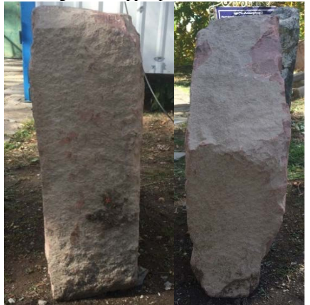
Figure 9b. Right side of the reverse of the stone block