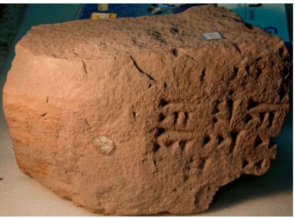
Figure 2 (Dara, 2017: 127)

The six-line inscription on this piece of stone is severely damaged, but the epigraphy is in the renaissance method, meaning that it was likely written during Rusa II's reign. Harutjunjan (2001: 390, 510), Payne (2006: 324) and Dara (2017: 129) published this inscription as well but Salvini's reconstruction seems more complete (Salvini, 2008: 577, A 12-5)<sup>iv</sup> with respect to the Karmir-blur, Adilcevaz, Armavir, and Ayanis temple inscriptions. According to the first and third lines, the inscription is an offering related to the construction of Haldi's Temple.