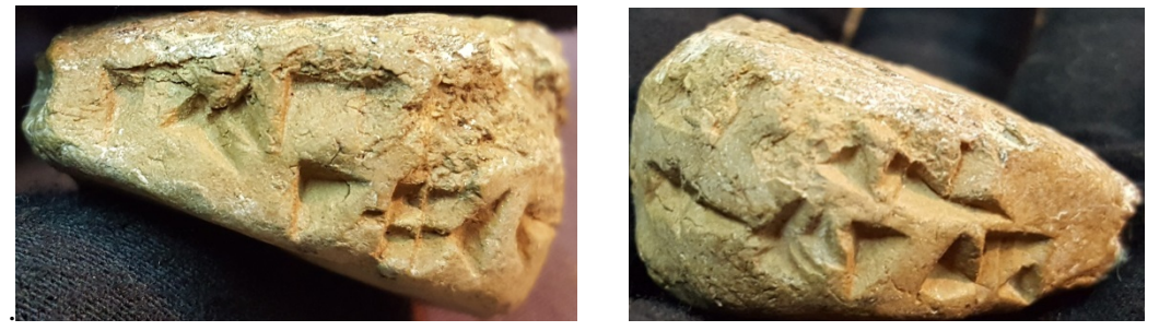
Figure 5b

There is not a single Urartian seal discovered at Bastam,<sup>xvii</sup> but several seal impressions have been identified on the bullae and tablets from the site, which provide us with significant information. The Urartian inscribed cylinder and stamp seal impressions could imply the seal bearer official degree, name, region, beliefs, and royal or public information.