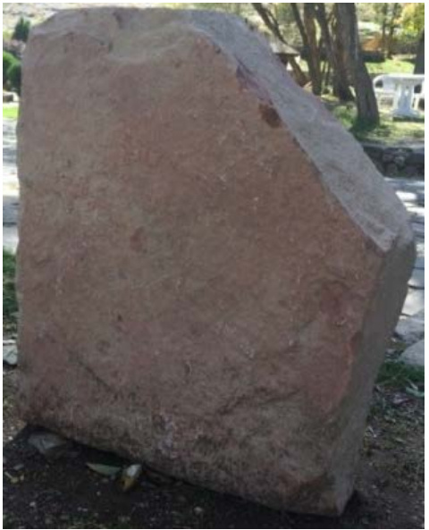
Figure 9c. Left side of the reverse of the stone block