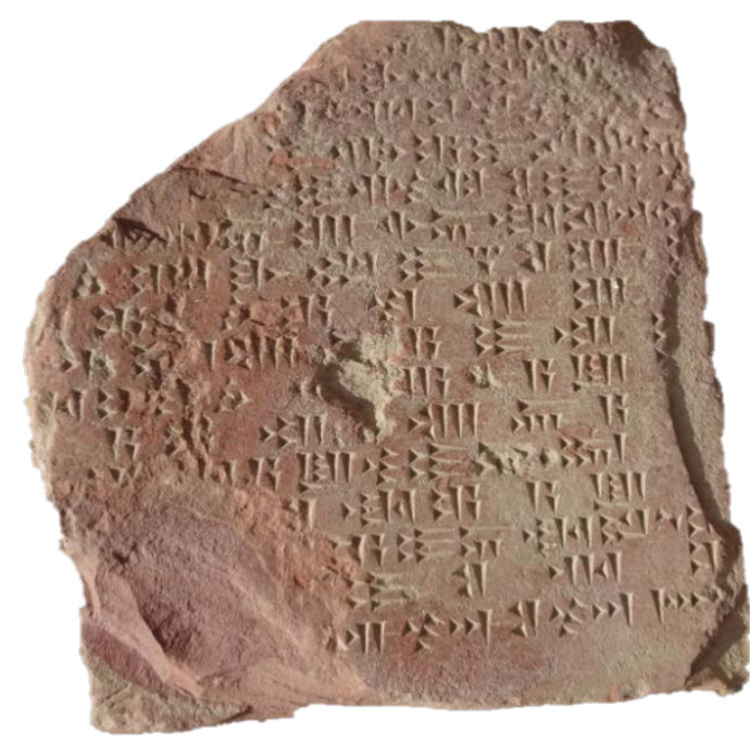
Figure 8. Obverse of the newly donated stone inscription

The stone block is 64 cm high, 56.5 cm wide and 19 cm thick. There is a sixteen-line Urartian cuneiform inscription inscribed on this piece of stone. The text is limited between about four-centimeter margins carved as thin lines and the signs are about 3 cm tall (Fig. 8).