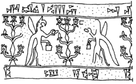
Figure 6b (Seidl, 1979: 137, A 1)